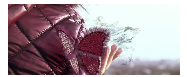
Quickly create stunning photorealistic renderings using Maya and NVIDIA GPUs.