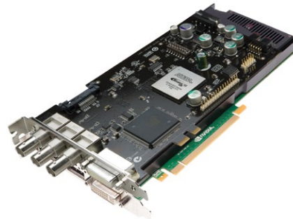
NVIDIA Quadro K4000 SDI