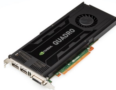
NVIDIA Quadro K4000