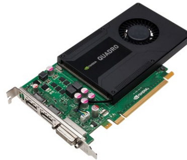
NVIDIA Quadro K2000