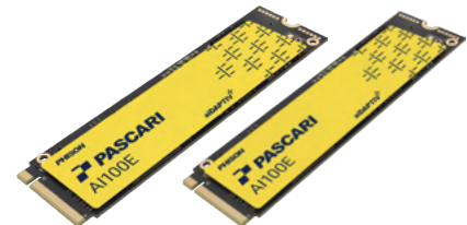
AI100E M.2 SSD