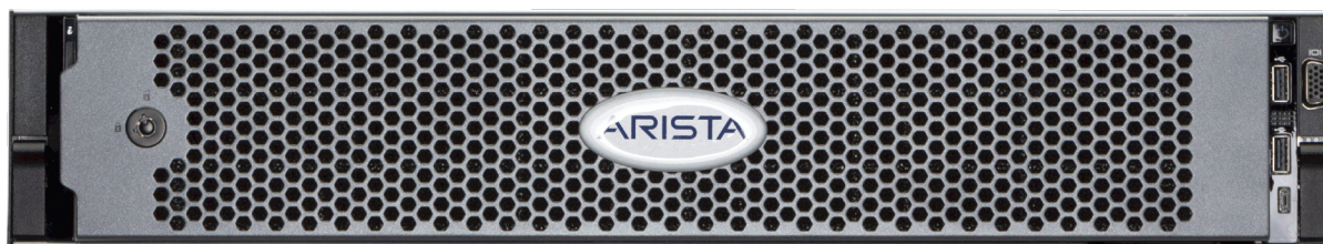
Arista DMF Service Node: DCA-DM-SDL